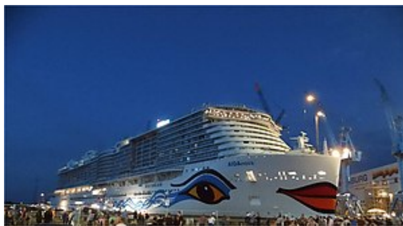
AIDAnova at Meyer Werft , August 2018